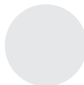
Polar White (FreedomCote™ finish)